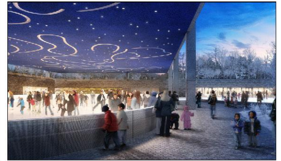
Recreational | LeFrak Lakeside Center at Prospect Park | Architect: Tod Williams Billie Tsien Architects

Sciame Construction is pleased to join the Greater New York Construction User Council in honoring all Outstanding Projects for 2014