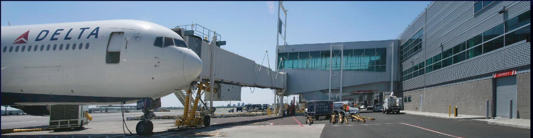
Delta Terminal 4 at John F. Kennedy International Airport

Congratulations to the 2014 Chairman's Reception honorees!